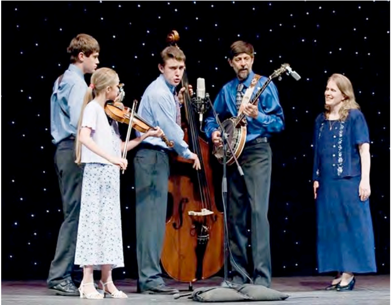
Youth in Bluegrass Contest – 2010